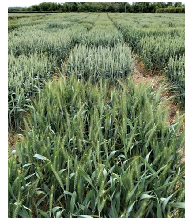
DFW wheat nursery