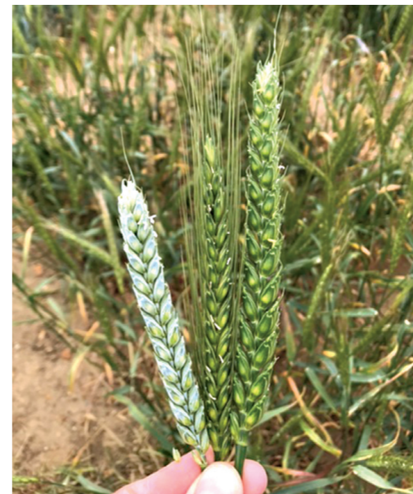
Resynthesised wheat ears