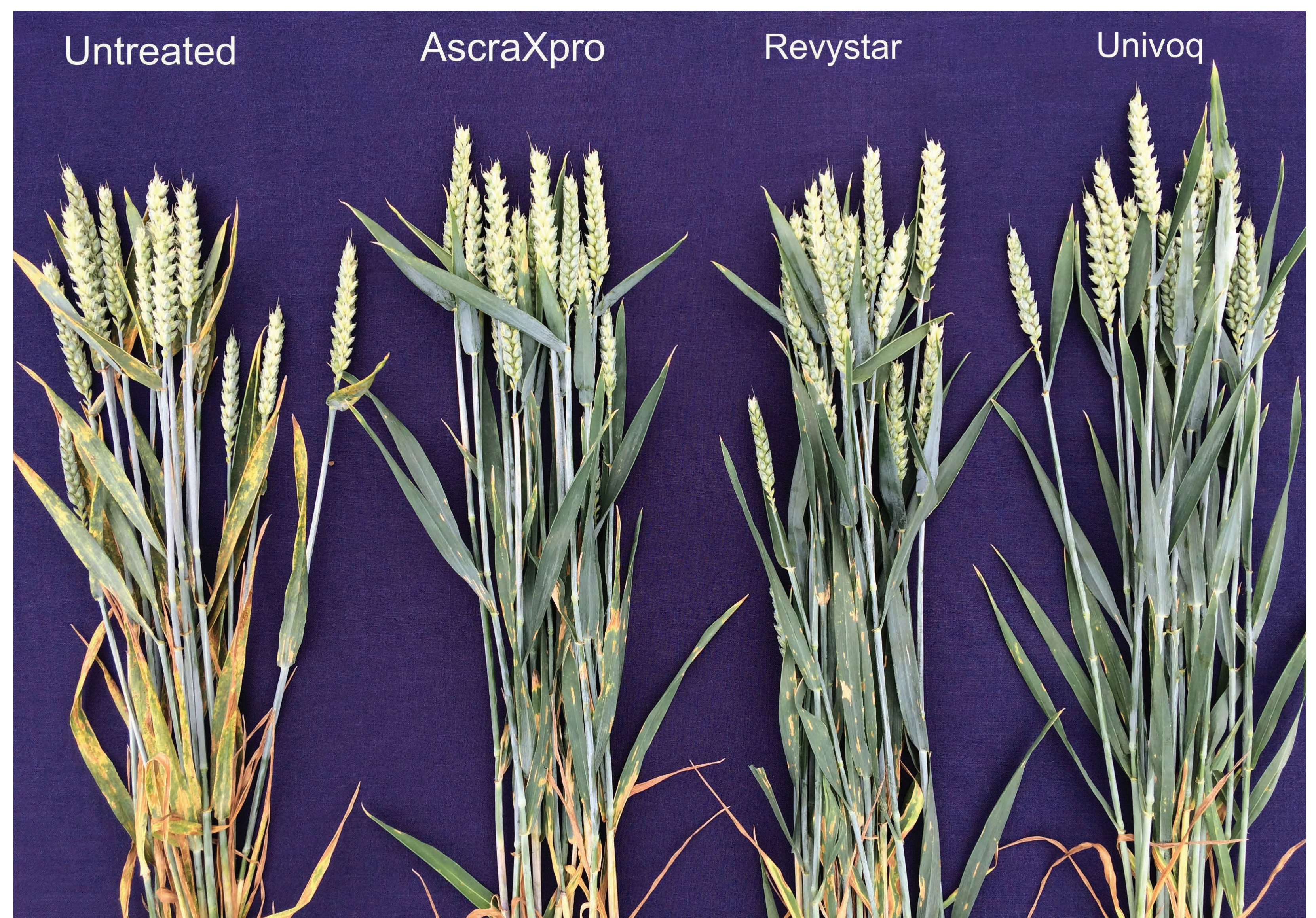
Cambridge new fungicides

All of the SDHIs have drifted in performance in recent years because of resistance development so they too need protecting. New fungicides are more expensive than older chemistry but they are much more consistent in their performance and they give more flexibility in timing and dose.